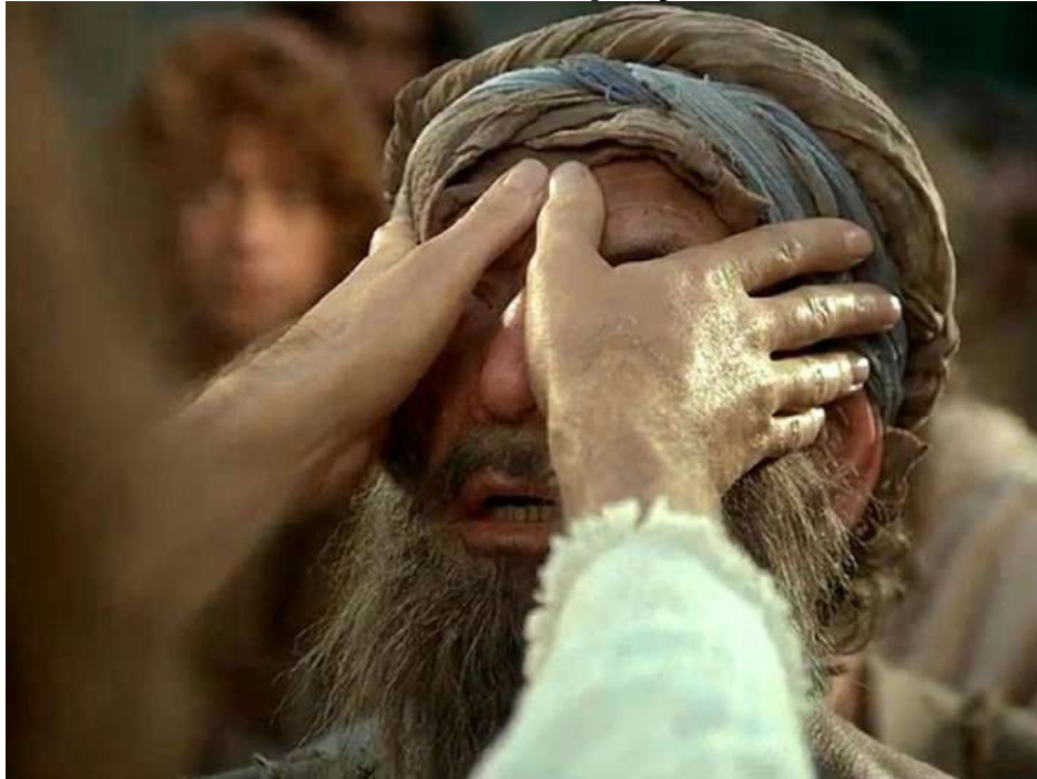
Jesus Heals the Man Born Blind.